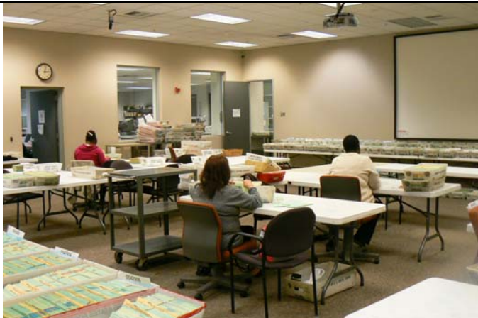
A few workers trying to sort through 100,000 absentee ballots November 13, 2006