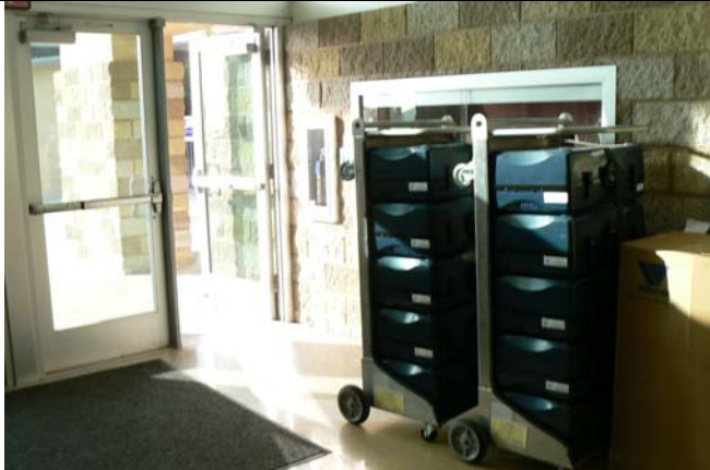
10 unsecured voting machines = $40,000 November 2, 2006