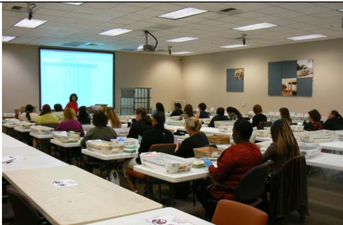
Twenty-six workers processing 100,000 absentee ballots - November 16, 2006