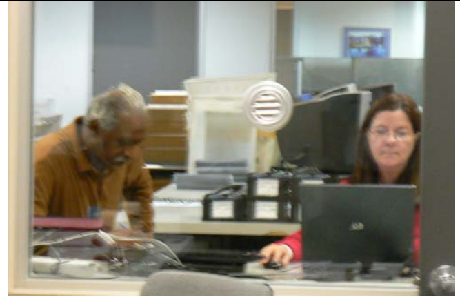
Absentee Ballot counting – glass barrier prevents meaningful observation – November 22, 2006