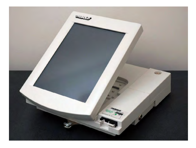
Figure 1: The Diebold AccuVote-TS voting machine

This paper reports on our study of an AccuVote-TS, which we obtained from a private party. We analyzed the machine's hardware and software, performed experiments on it, and considered whether real election practices would leave it suitably secure. We found that the machine is vulnerable to a number of extremely serious attacks that undermine the accuracy and credibility of the vote counts it produces.