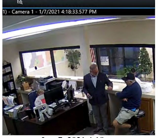
Jan. 7, 2021 4:18pm Hall stands beside Ridlehoover's desk. (Ex. 8 at 49.)