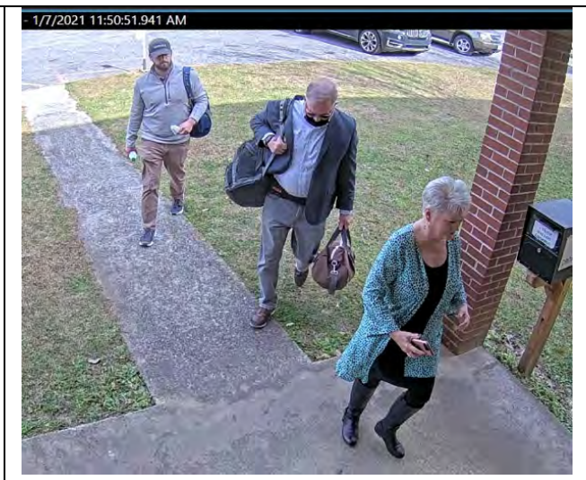
Jan. 7, 2021 11:50am Latham leads Hall & Cruce in with bags (Ex. 4 at 38.)