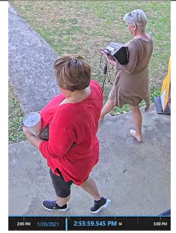
Jan. 20, 2021 2:55pm Latham carries borrowed scanner out of the elections office. (Ex. 5 at 14.)